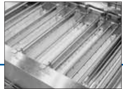
The grader's continuously rotating rollers accurately and gently size shrimp.

Laitram's Model AG 70 Adjustable Grading System provides highly accurate grading, gentle product handling, high capacity, and easy operation and maintenance. The complete grading system includes a feed and wash tank, an inspection belt, the Model AG 70 Adjustable Grader, and two take-out conveyors. Take-out and packing conveyors can be customized to meet processors' specific needs.