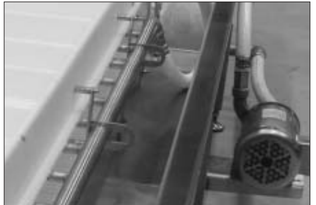
The Model CH100 has an open design for easy access when cleaning.

Since 1949, Laitram has been a supplier of food processing equipment throughout the world. We have built our reputation on quality machinery, expert service and replacement parts. Call us. Together, we'll select the best system to meet your processing needs.