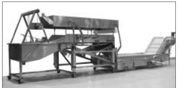
A fully-integrated cooker/chiller system can be created by using the CH100 with Laitram's CTX Cooker.